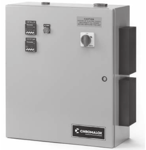
Optional Control Panel 3