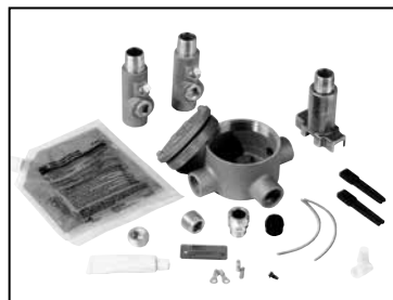
Splice Kit for Hazardous Locations HL-S 382205