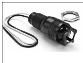
120V Division 1 Signal Light Kit D1SL1 393684

Explosion proof pilot light for use with HL-PC kit. Pilot light kit made with 3/4" NPSM threads and 8" flexible leads. Red LED lens. For 208-240V system.