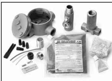
Power Connection Kit for Hazardous Locations HL-PC 382192