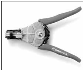
Stripping Tool 393510

180' Roll aluminum foil installation tape with pressure-sensitive acrylic adhesive. 2-mil thickness with high tensile strength; 2-1/2" wide. 200°F (93°C) rating. Minimum application temperatures 40°F (5°C)