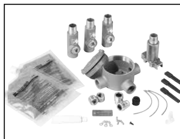
Tee Kit for Hazardous Locations HL-T 382213