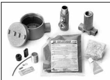
End Seal Kit for Hazardous Locations HL-ES 382221