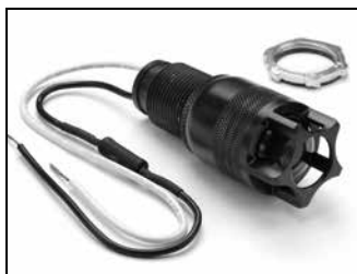
208 - 240V Division 1 Signal Light Kit D1SL2 393692

Explosion proof pilot light for use with HL-PC kit. Pilot light kit made with 3/4" NPSM threads and 8" flexible leads. Red LED lens. For 208-240V system.