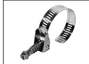
Stainless Steel Pipe Strap Kit Attachments PS-1, 3, 10 & 20

66' Roll of glass cloth tape with pressure-sensitive thermosetting silicone adhesive 3/8" wide. 310°F (155°C) rating. Strap at one foot intervals at minimum application temperatures of -40°F (-40°C)