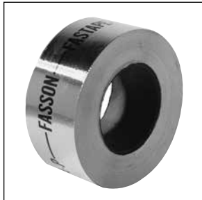
Aluminum Tape Cable Attachments AT-1 383355

180' Roll aluminum foil installation tape with pressure-sensitive acrylic adhesive. 2-mil thickness with high tensile strength; 2-1/2" wide. 200°F (93°C) rating. Minimum application temperatures 40°F (5°C)