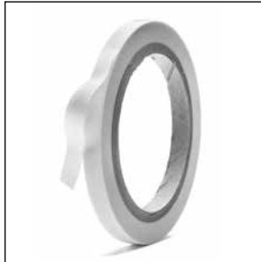
Fiberglas® Tape Cable Attachments FT-3 389941

66' Roll of glass cloth tape with pressure-sensitive thermosetting silicone adhesive 3/8" wide. 310°F (155°C) rating. Strap at one foot intervals at minimum application temperatures of -40°F (-40°C)